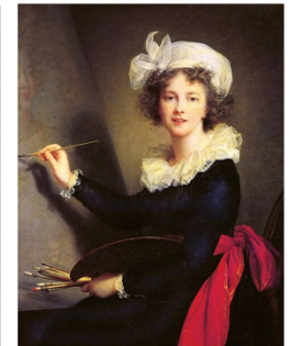
Elisabeth Vigée-Lebrun, Self-Portrait , 1790.