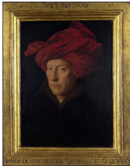
Jan van Eyck, Self-Portrait , 1433.

Prior to attending class, students will explore a selection of course content (videos and reading) in our Canvas classroom. We will meet in person to participate in small-group and discussion activities relating to the course material on Monday from 1-2:15 PM, Osceola Campus - Building 1, Room 127.