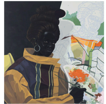
Kerry James Marshall, Untitled (Painter) , 2009.