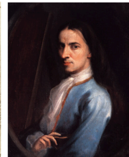
Juan Rodríguez Juárez, Autorretrato (Self-Portrait) , 1719.