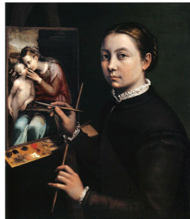
Sofonisba Anguissola, Self-Portrait at the Easel , 1556.