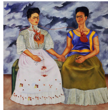
Frida Kahlo, Las dos Fridas , 1939.