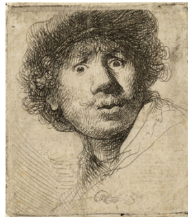
Rembrandt van Rijn, Self-Portrait with Beret , 1659.