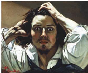
Gustave Courbet, Le Désespéré (Self-Portrait) , 1843.